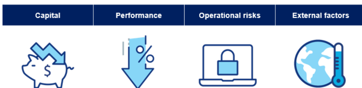
Figure 2: comprehensive trigger framework