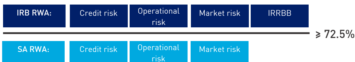
Figure 3. Components of the IRB capital floor

Credit Risk includes Counterparty Credit Risk, Credit Valuation Adjustment and Securitisation.