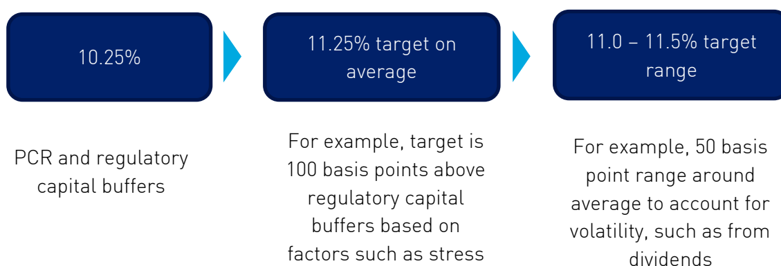
Figure 1. Example of setting a management target at a D-SIB