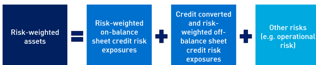
Figure 1. Standardised RWA calculation under APS 110

Under APS 110, the minimum CET1 capital requirement is calculated as 4.5 per cent multiplied by RWA, where RWA is determined as per Figure 1.