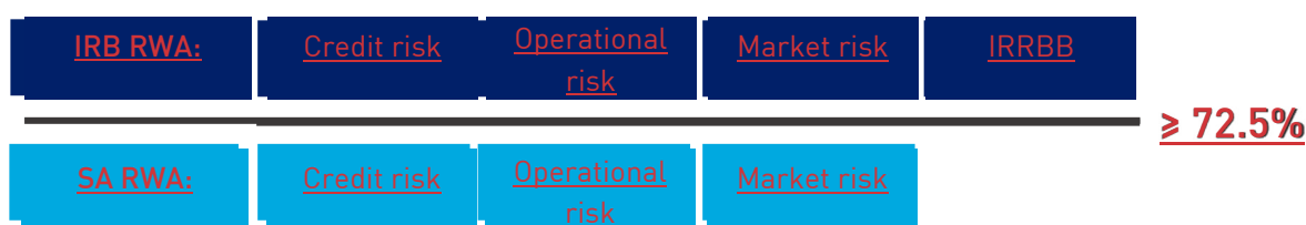
Figure 2-Figure 3. Components of the IRB capital floor

Credit Risk includes Counterparty Credit Risk, Credit Valuation Adjustment and Securitisation.