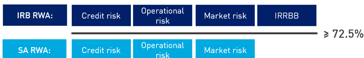
Figure 2. Components of the IRB capital floor

Credit Risk includes Counterparty Credit Risk, Credit Valuation Adjustment and Securitisation.